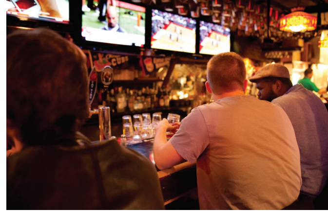
The original bar downstairs at Nick's.

With 52 high-definition TVs, Nick's is the place to watch IU football and basketball