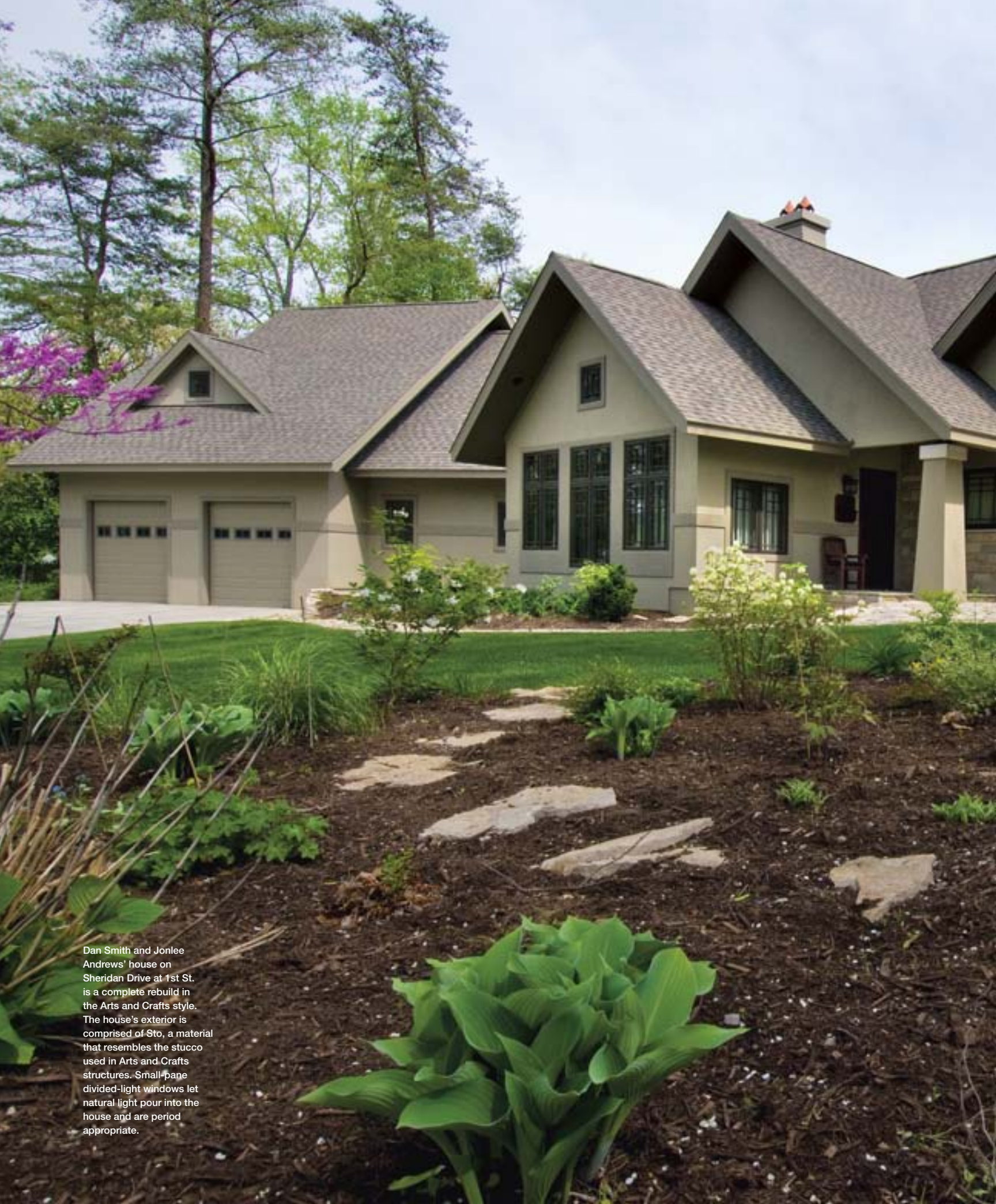
Dan Smith and Jonlee Andrews' house on Sheridan Drive at 1st St. is a complete rebuild in the Arts and Crafts style. The house's exterior is comprised of Sto, a material that resembles the stucco used in Arts and Crafts structures. Small-pane divided-light windows let natural light pour into the house and are period appropriate.