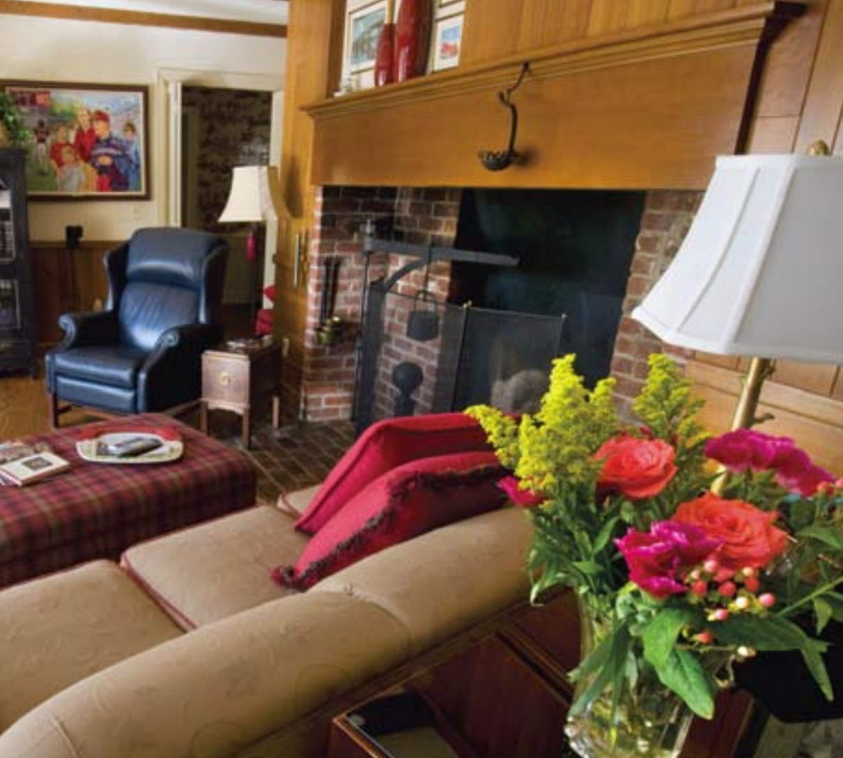
1. "The blueprints call it the 'keeping room.' The term dates back to colonial times when houses just had one big room and all activity was centered around a large fireplace," says Patty. With its massive fireplace and comfy furniture, the Abshires' keeping room is a favorite place to relax. The family portrait on the back wall was done by Trisha Weiser Wente, a local artist.