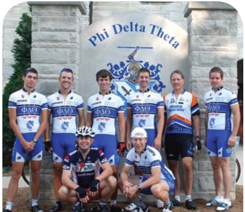
Phi Delta Theta coaches and riders pose before departing for a Nashville 90 bike ride. Brian Drummy