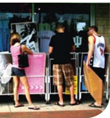
Dorm room decor? Sidewalk shoppers check out the print and poster selection at Greetings on East Kirkwood. Timothy Carter-East