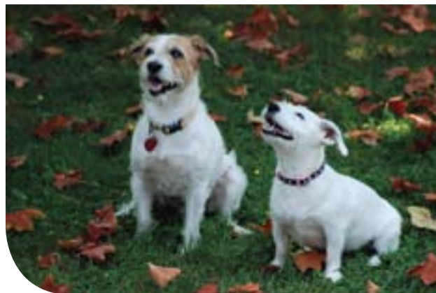
Jack Russell terrier buddies Calvin (left) and Minnie hang out in Van Buren Park.