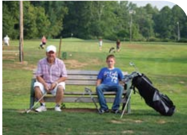
Grandfather and grandson between holes at Taylors' Par 3 Golf Course south of town.