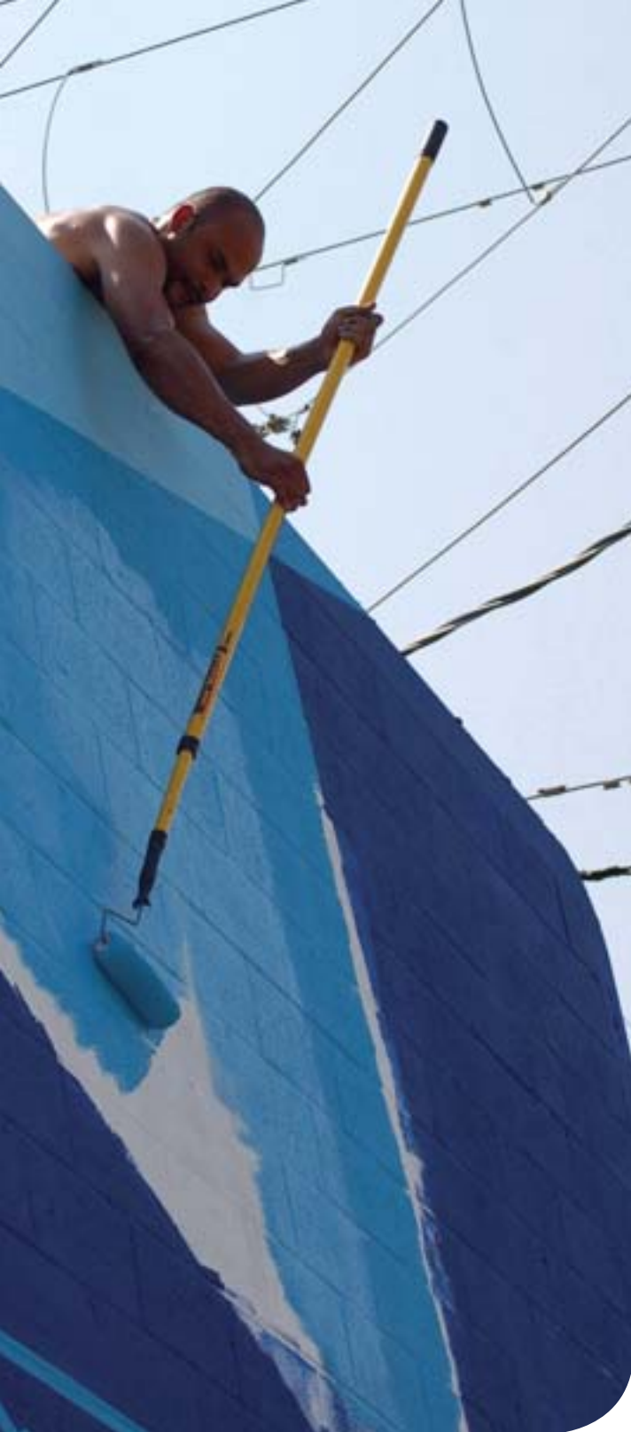
Bloomington Playwrights Project gets an exterior makeover.