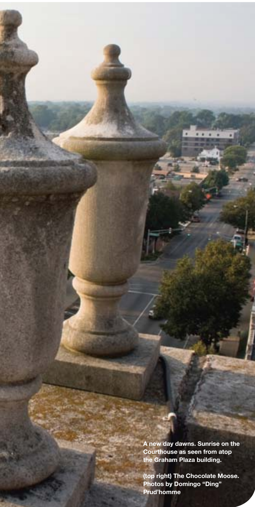
A new day dawns. Sunrise on the Courthouse as seen from atop the Graham Plaza building.