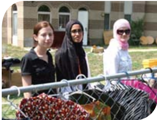
Visitors of The Islamic Center of Bloomington on East Atwater shop at the yard sale—an annual fundraiser for the mosque. Timothy Carter-East