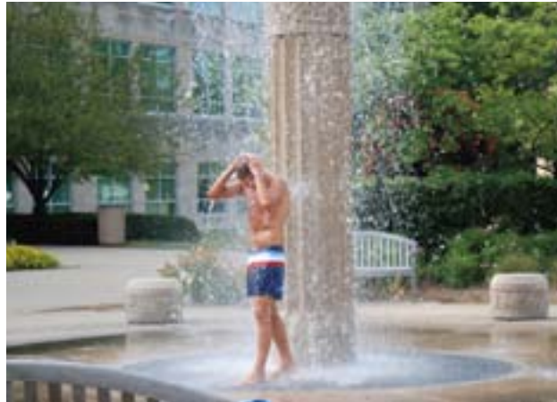
An afternoon cool-down in the fountain at IU's Bess Meshulam Simon Music Library and Recital Center.