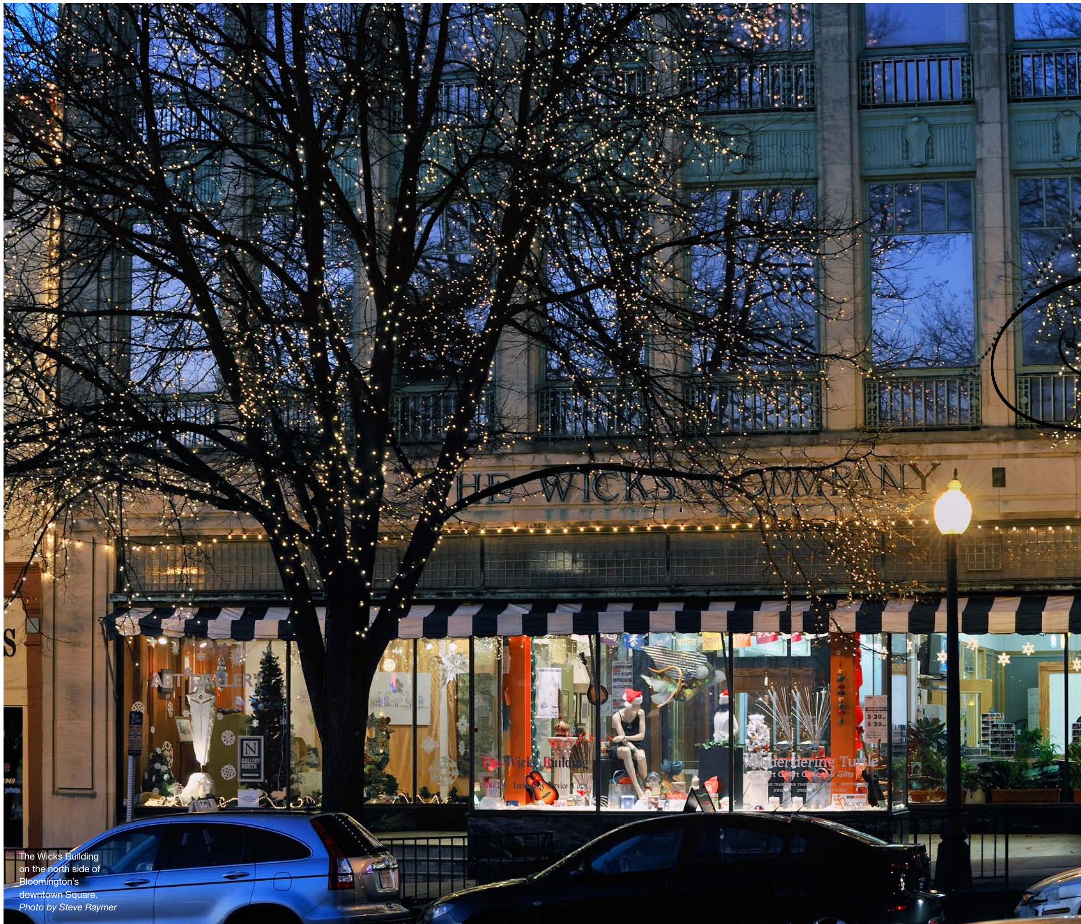
The Wicks Building on the north side of Bloomington's downtown Square.