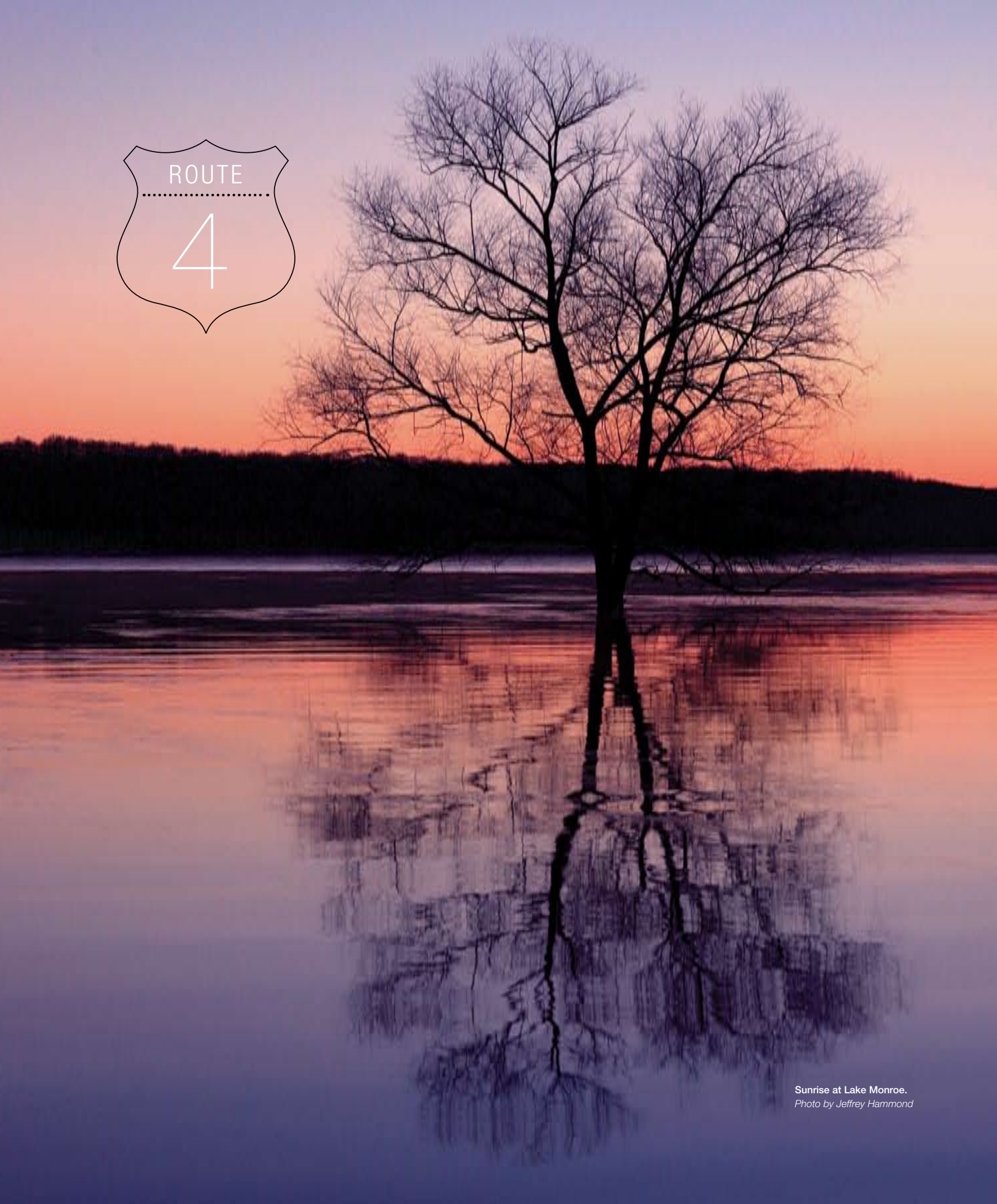
Sunrise at Lake Monroe.