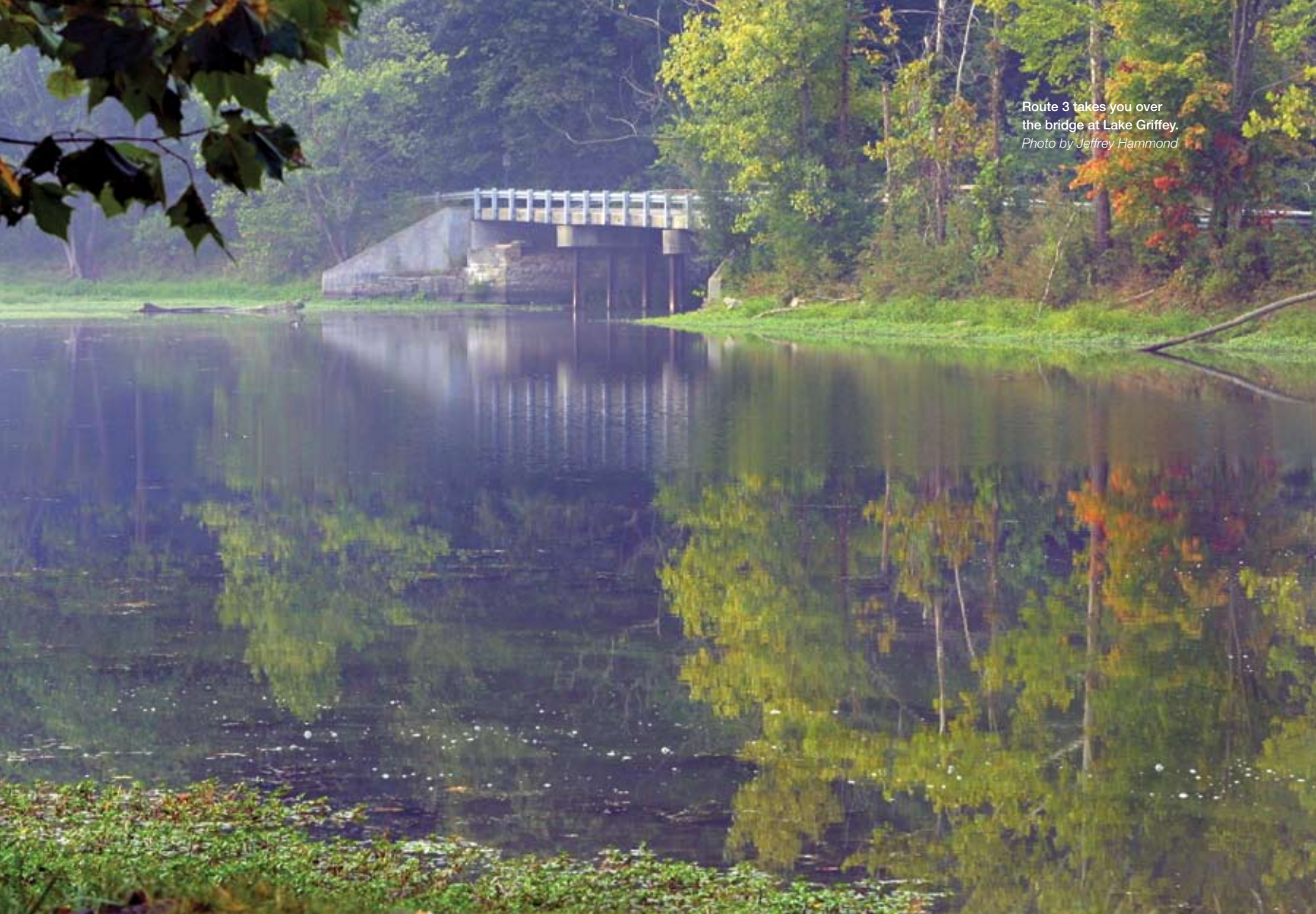
Route 3 takes you over the bridge at Lake Griffey.