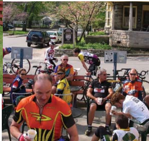
Early morning coffee before the ride.