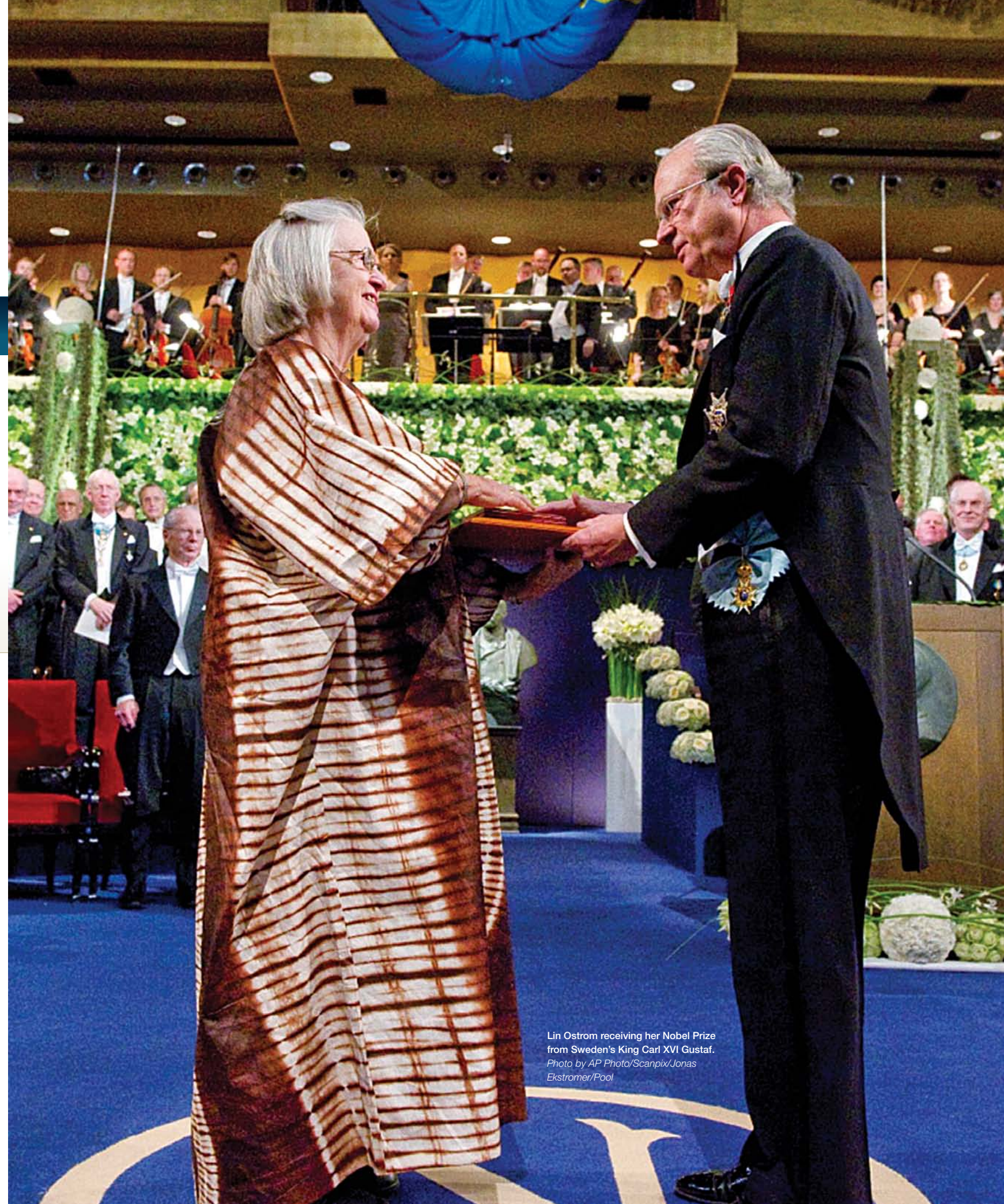
Lin Ostrom receiving her Nobel Prize from Sweden's King Carl XVI Gustaf.

At 4:30 pm the orchestra plays the Swedish national anthem, and we stand as King Carl XVI Gustaf, Queen Silvia, and other members of the royal family take their seats. Then the 12 laureates being honored in Stockholm enter the hall to the strains of Mozart's "March in D Major." (Earlier in the day, President Barack Obama received his medal in Oslo, Norway, where the Peace Prize ceremony takes place.) Lin is resplendent in African dress and stands out among the more classic attire of her fellow laureates. They take their seats in "prize order," according to Nobel's will: first physics, then chemistry, physiology or medicine, literature, and finally economics. Each prize is introduced by a representative of the awards committee, speaking in Swedish (fortunately for us the remarks are translated in the program), with musical interludes between the prizes. Following remarks about the prizes themselves, each laureate is introduced. An elderly gentleman, moving in a stooped shuffle as though he has done this a thousand times,