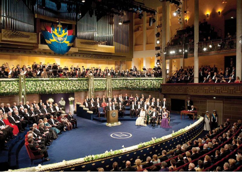
The stage of the Stockholm Concert Hall moments before the awards ceremony began. New laureates, past winners, the royal family, and other dignitaries all in place.

lecture was not open to the public. The other laureates made up for the loss.