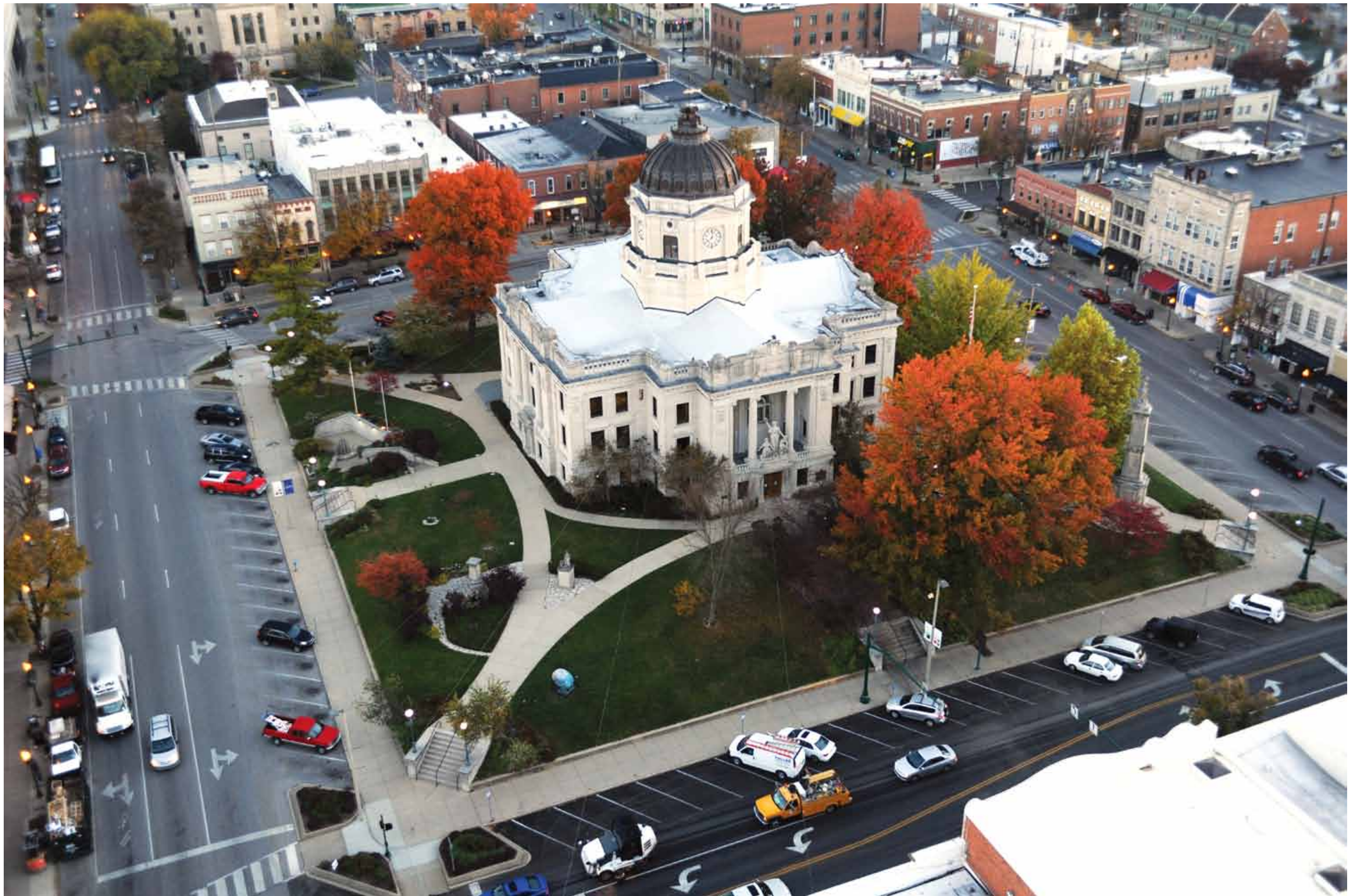
The Monroe County Courthouse, looking toward the northeast side of downtown. "It is one of the prettiest courthouses in Indiana," says photographer Baumann. "Bloomington is very fortunate to have preserved its downtown. So many places have torn down the old buildings."