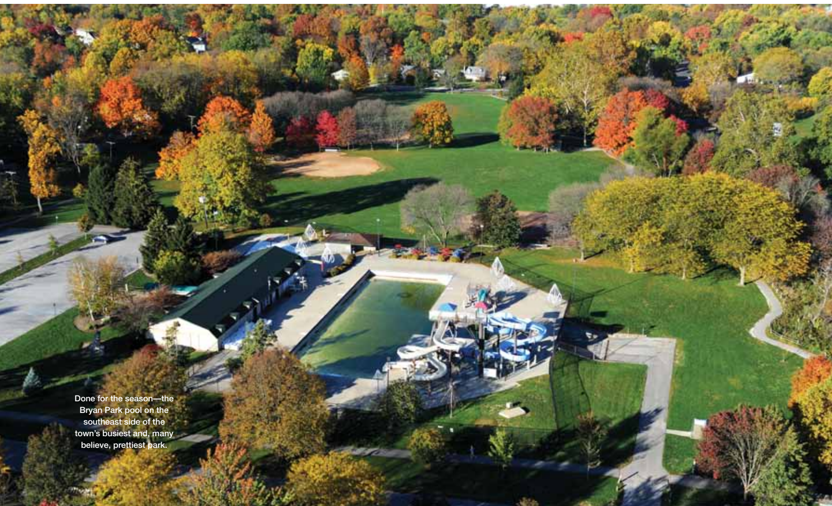
Done for the season—the Bryan Park pool on the southeast side of the town's busiest and, many believe, prettiest park.