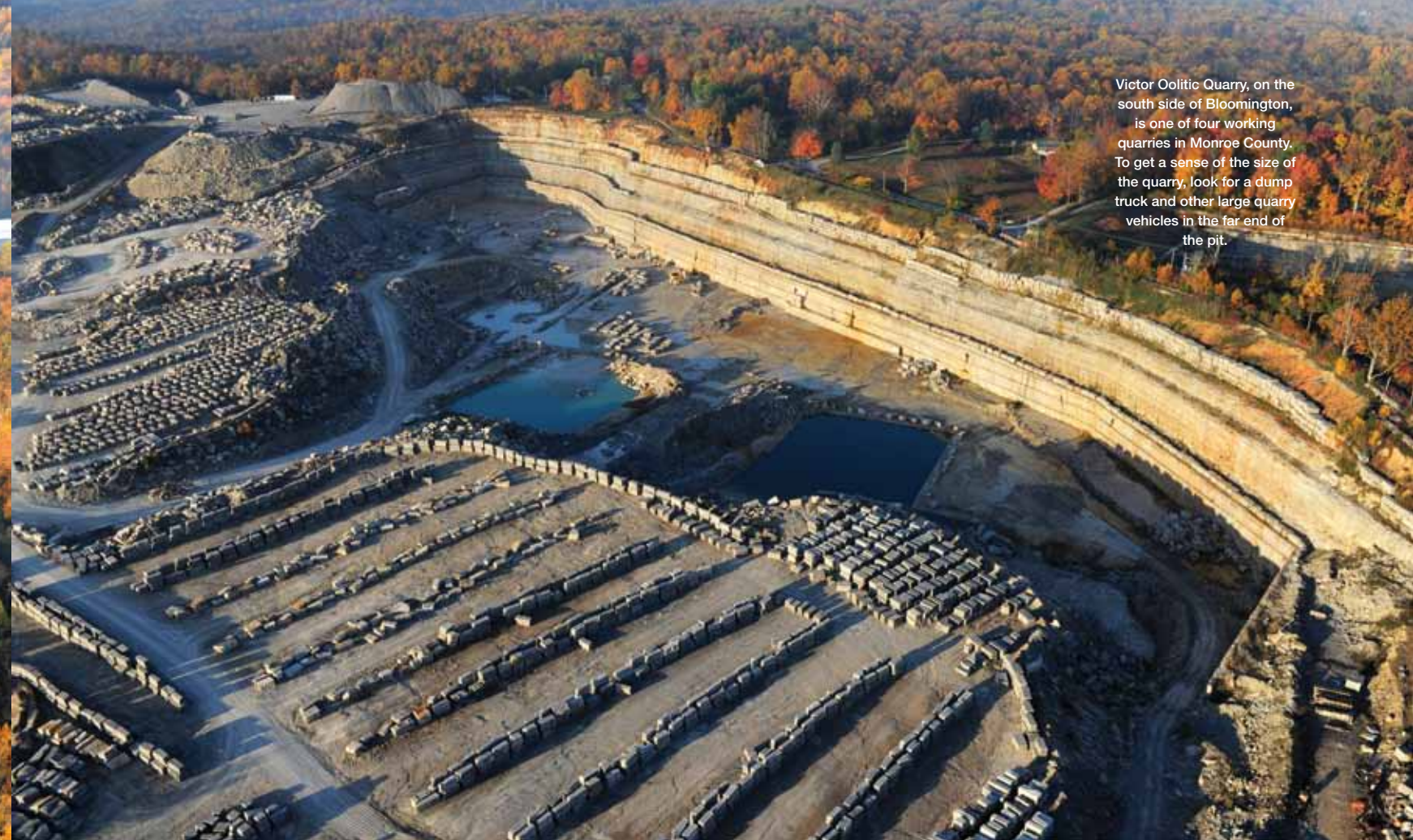
Victor Oolitic Quarry, on the south side of Bloomington, is one of four working quarries in Monroe County. To get a sense of the size of the quarry, look for a dump truck and other large quarry vehicles in the far end of the pit.