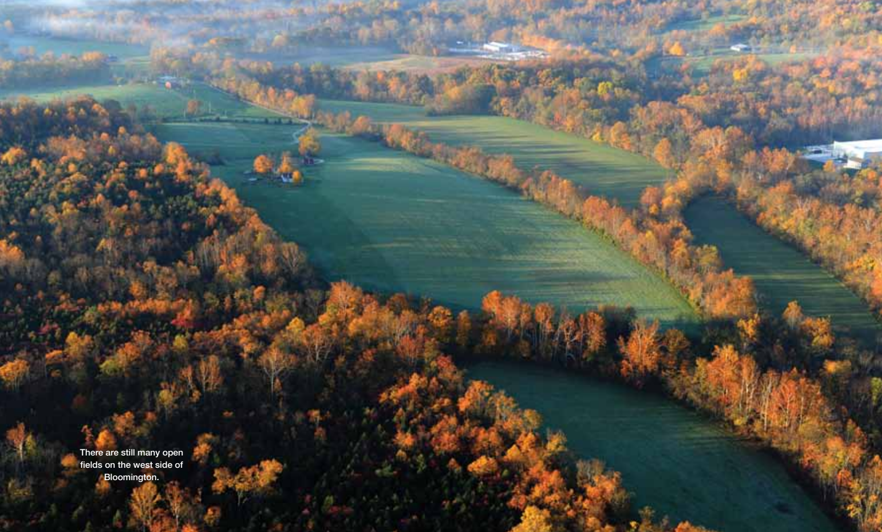
There are still many open fields on the west side of Bloomington.