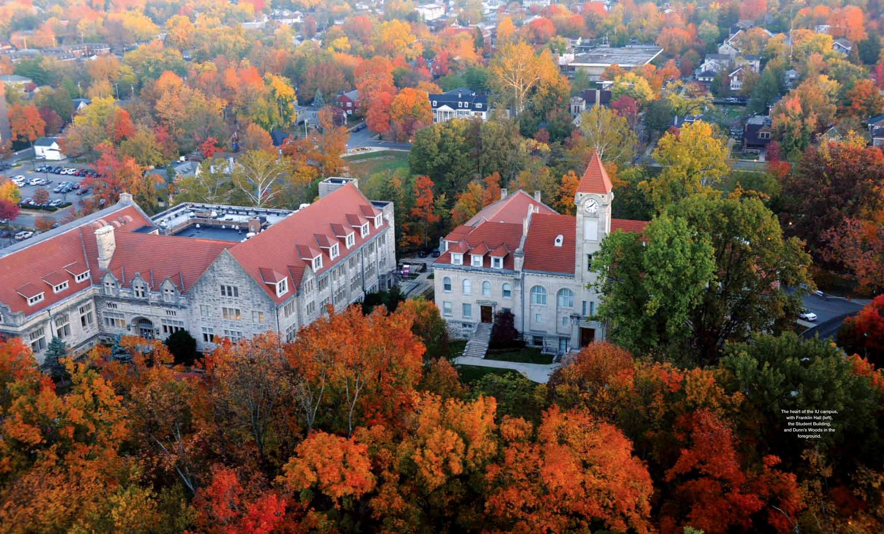
The heart of the IU campus, with Franklin Hall (left), the Student Building, and Dunn's Woods in the foreground.