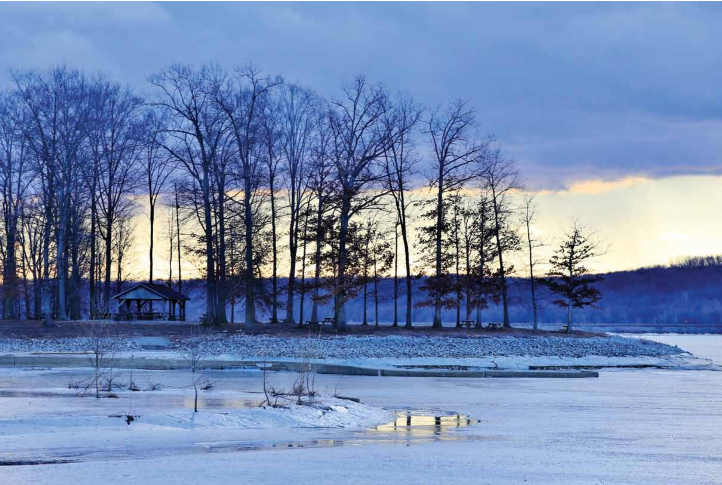
It's a blue day at the Lakeview Shelter at Paynetown as heavy stratus clouds usher in snow flurries.