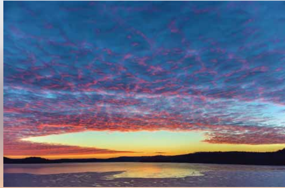
(below) The black expanse of the Charles C. Deam Wilderness divides a crimson and orange sky from its reflection on the icy waters of Lake Monroe. Ice on the lake seems to swirl out of the indigo water in the subfreezing temperature. (inset) Red-highlighted cumulus clouds encapsulate the rising sun on a subzero morning with 20-mile-per-hour winds.