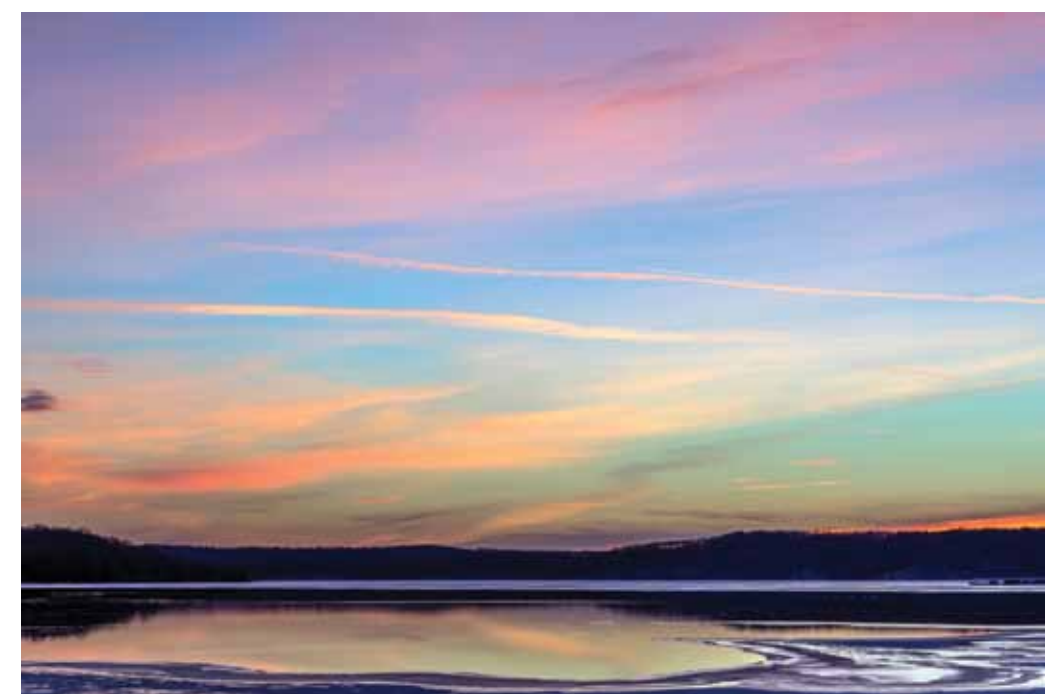
(right) When cold temperatures dramatically reduce the humidity in the air, sunrises over Lake Monroe develop into brilliant displays of color.